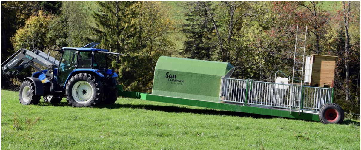
The "pig caravan" can easily be moved with a tractor, thanks to its two wheels and coupling device.

patches of the sward and lets the area rest for 30 to 60 days. With this system, the farm manages to maintain a grass cover of 80 %.